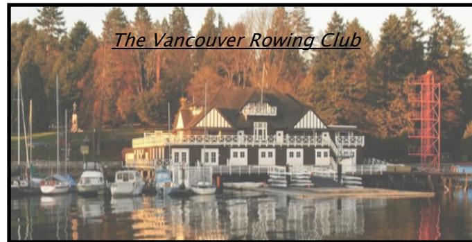
The Vancouver Rowing Club

We are a leader in the HIV/AIDS movement due to your continued commitment.